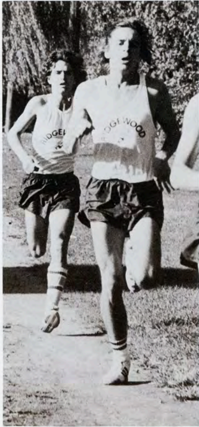
Run, Run, Run . . .