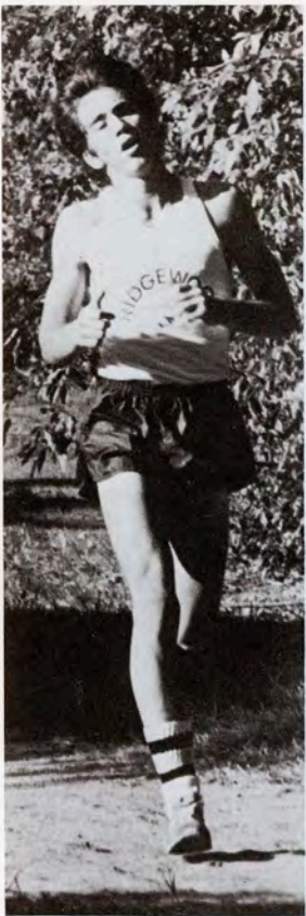
I've huffed and puffed, and I'm going to fall down.