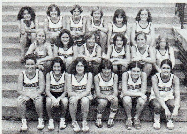
Ridgewood Cross Country Team

110 North Maple Avenue Ridgewood, New Jersey 445-0425