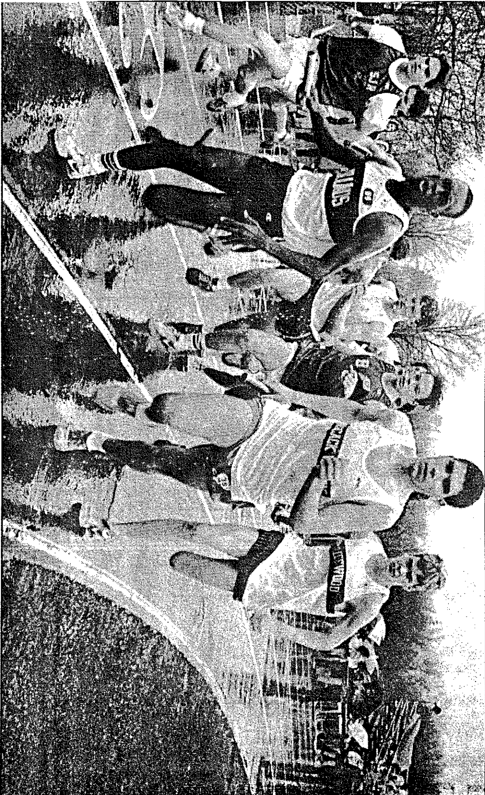
Competitors in the 3,200 relay at the Bergen Jack Yockers Relays round the first turn. Ridgewood eventually won in 8:16.8.