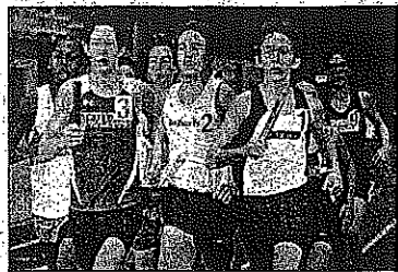
Ridgewood's anchor in 4-x-400 steals the show at Bergen County Relays.