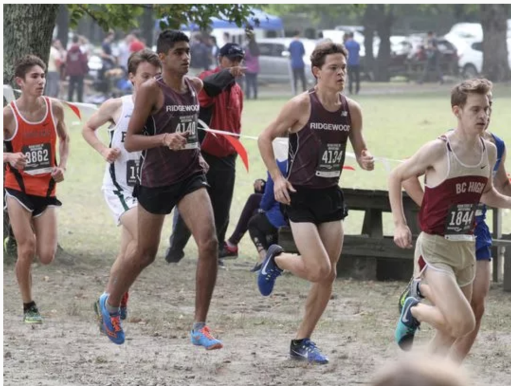
Ridgewood boys cross-country were the No. 1 team in The Record poll for the week of Sept. 23, 2017.