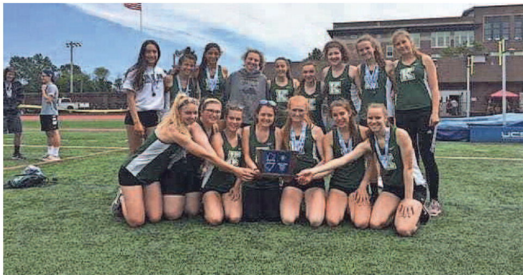
The Kinnelon girls track and field team won its first NJSIAA Sectional title since 2011.