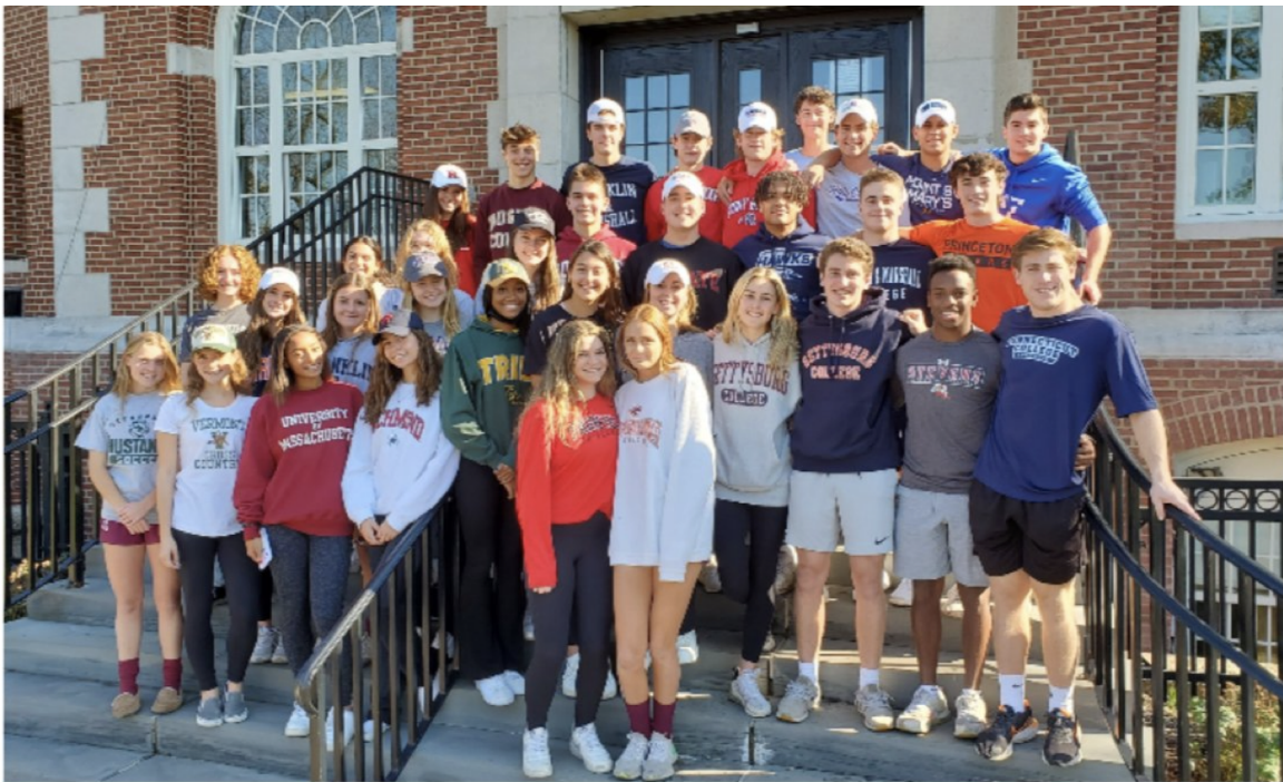
Ridgewood student-athletes wear the shirts of their college choices. SUBMITTED